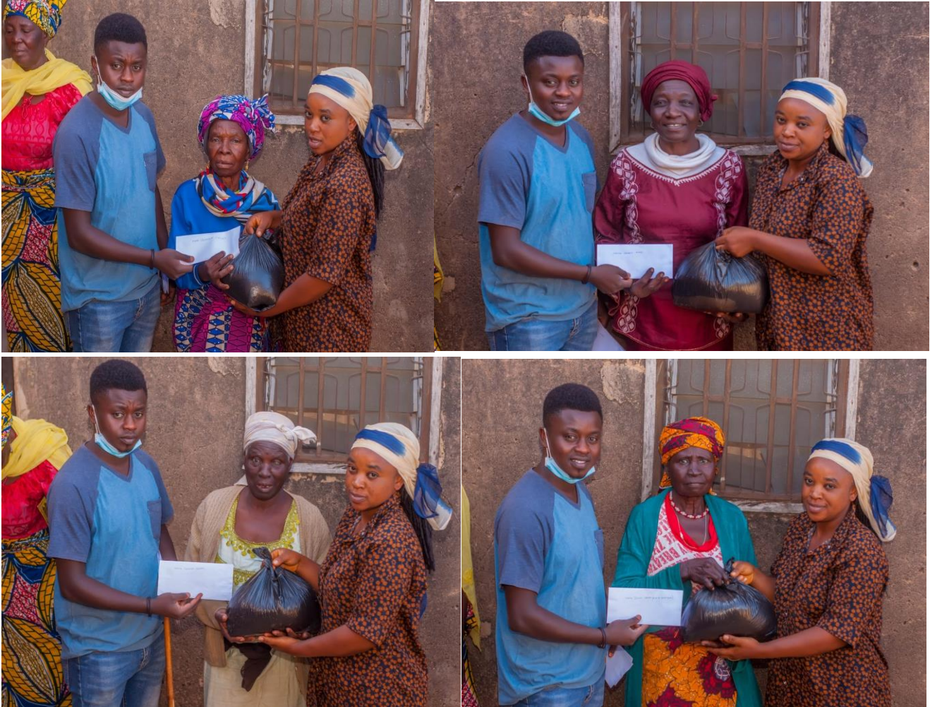
Picture of widows in Fudawa Community Jenta Adamu Community and Living Faith Church Angwan Rukuba of Plateau State